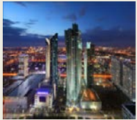
Tour to Astana city