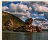
Weekend in the best resort hotel in Borovoe – Rixos Borovoe