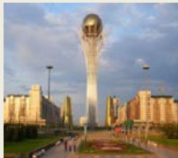
Visit the main sights of the city