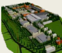
Trip to the Industrial park