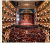
Concert program and gala dinner at the Opera and Ballet Theatre "Astana Opera"