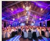
Cocktail evening at the Marriott